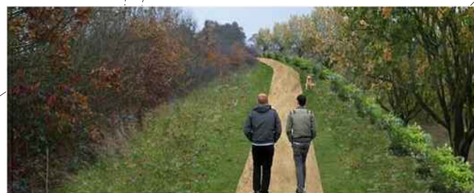
Section A-A: Ridge footpath.