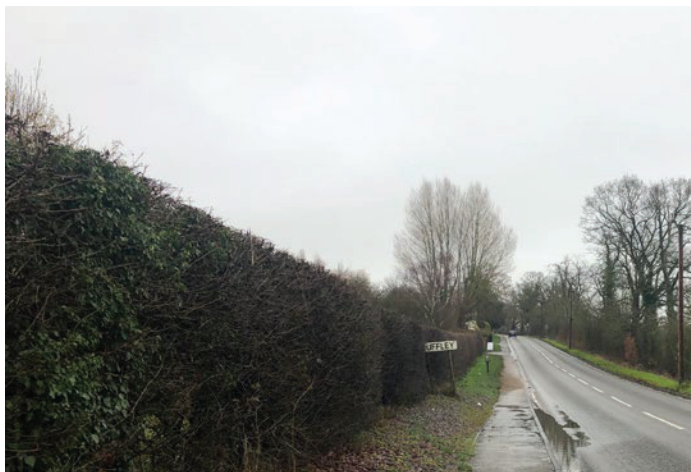
VIEW D Dense hedge on Northaw Road to be strengthened and gapped up.