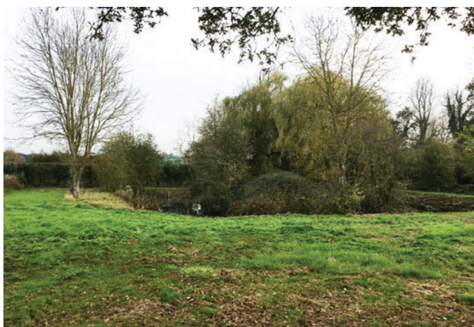
VIEW B Planting around pond on SW corner to be strengthened and existing planting densified around the outer edge of the pond to enhance and densify existing planting and close any gaps