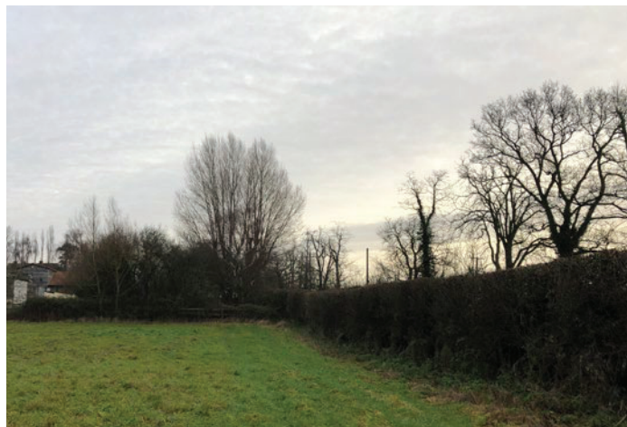
VIEW E View from within site looking east showing existing dense hedge along Northaw Road to be densified and enhanced to close any gaps.