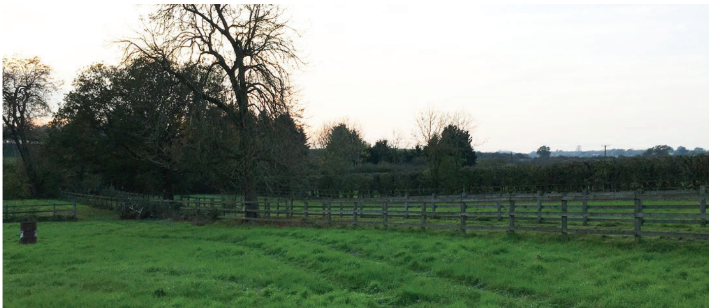
VIEW A - View from within the site looking at the trees and hedges on the north and west - Existing planting to be densified to close any gaps and hedges interspersed with specimen trees.